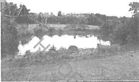
THE HOME POND – WHERE OVER 150 MALLARDS HAVE BEEN REARED DURING THE LAST THREE BREEDING SEASONS