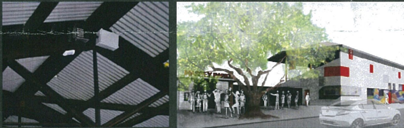
L to R: The installed Mosquito Unit; An artists impression of the revamped Massey Park Complex.

Since its installation there has been minimal damage to the stand. With the Massey Park complex now in for a total modernisation, the Council has specified that the Mosquito Unit is to be included in all tenders put forward for the construction works. Vandals can be assured that the Mosquito will continue to protect Massey Park.