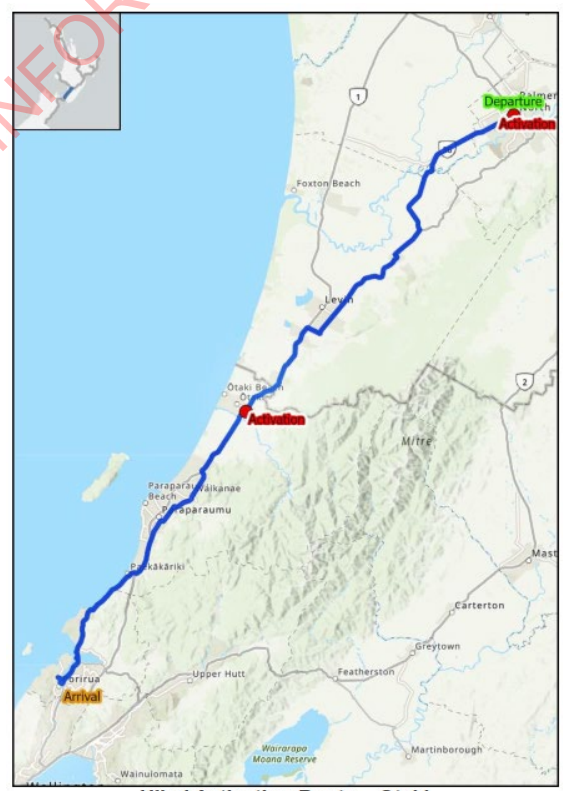
Hikoi Activation Route - Otaki

NOTE: Originally a mass pōwhiri was planned at Ngāti Toa domain in Porirua on Sunday 17<sup>th</sup>, however this mass event was cancelled on 6<sup>th</sup> November. It appears this cancelled event is still being advertised in some locations, in some cases with an alternate location. Porirua City Council and Ngāti Toa representatives are working on getting messaging aligned – TBC.