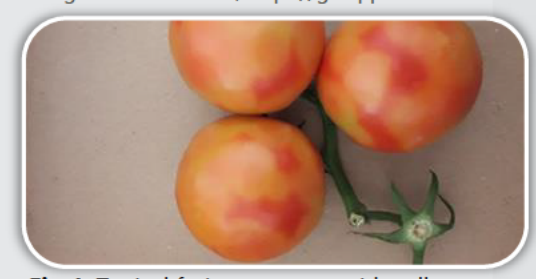
Fig 4: Typical fruit symptoms with yellow spots.