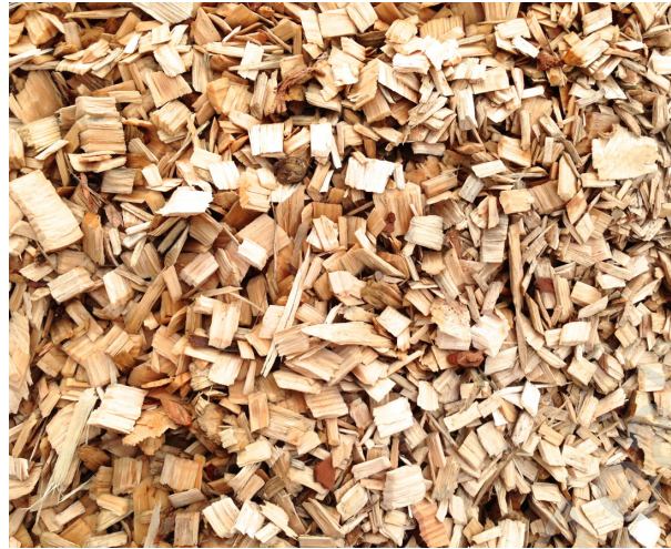
Figure 2 – Wood chips