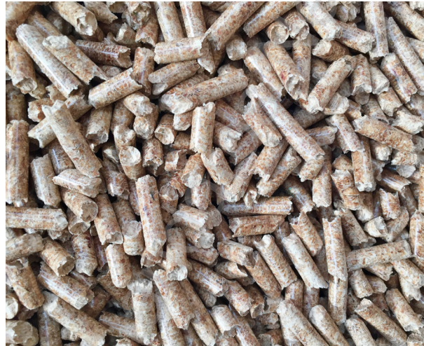
Figure 3 – Wood pellets