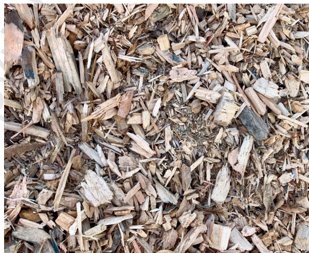
Figure 4 – Hog fuel