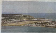
The city council wants to sell-off a 34% holding in Wellington International Airport.