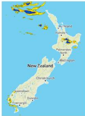
Thursday 19 October 2023 0000hrs