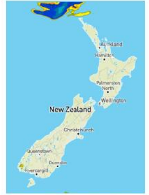
Thursday 19 October 2023 1200hrs

Valid Thu 19-Oct-2023 through Sun 22-Oct-2023