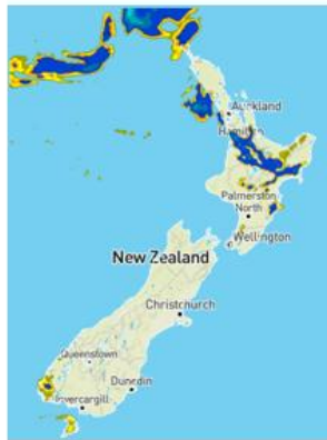
Wednesday 18 October 2023 1800hrs