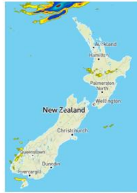
Thursday 19 October 2023 0600hrs