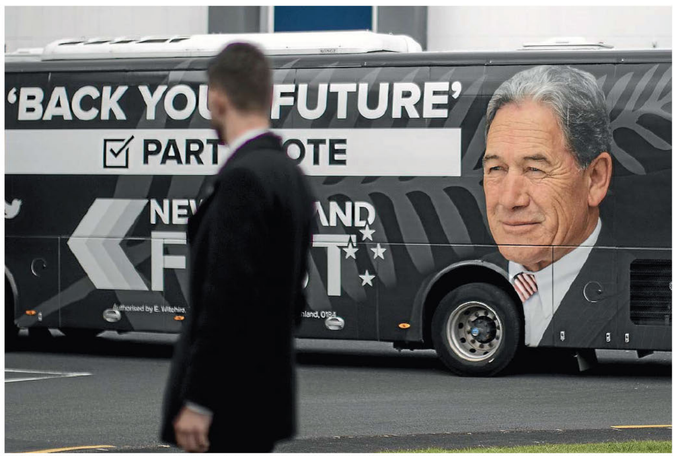
The Crown said some money was spent on a video of Winston Peters' bus touring New Zealand.