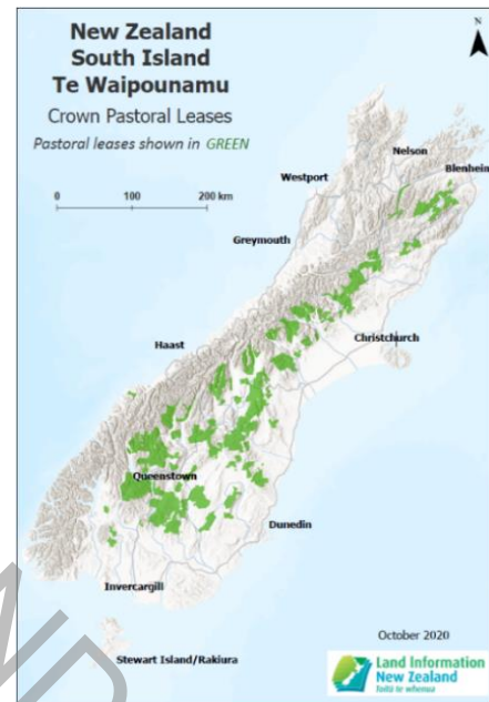
Figure 4: Map of Crown pastoral land

The Commissioner of Crown Lands (the Commissioner) makes decisions on discretionary activities, easements, and commercial recreation permits and is responsible for certain decisions and functions under the CPLA and the Land Act. The Resource Management Act also applies to Crown pastoral land, and consent from the Commissioner does not affect the need for leaseholders to comply with relevant regional and district plan requirements.