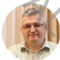
Craig Harris, Commissioner of Crown Lands