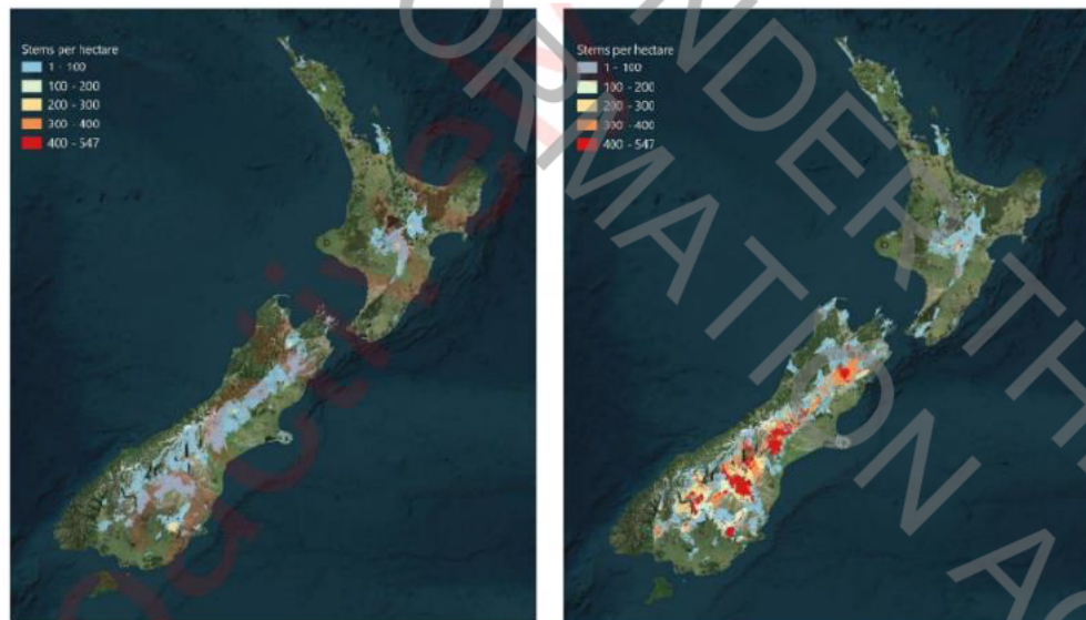
Figure 9: Wilding Conifer Baseline infestation 2021 and abandoned controlled activities 2072