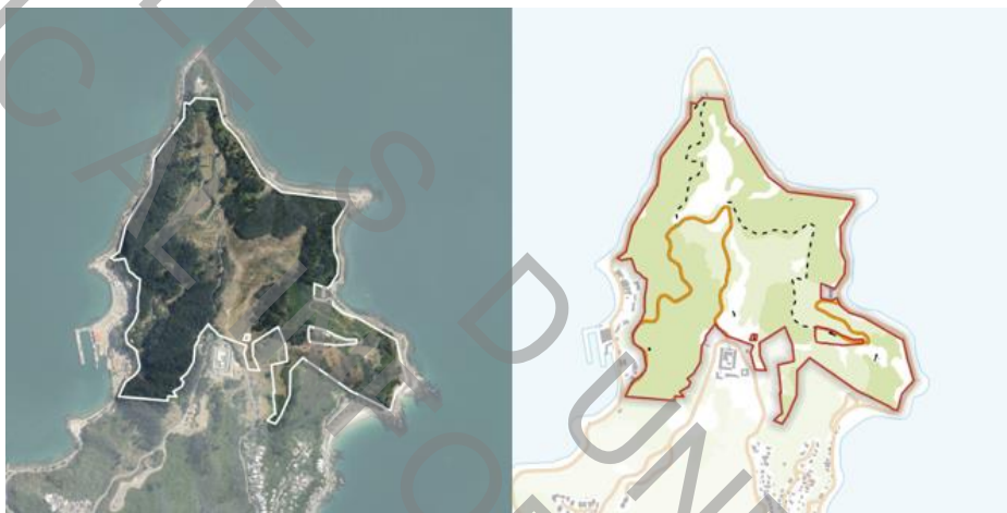
Figure 6: Aerial and topographic maps of the land at Watts Peninsula

Following those discussions, advice will be prepared for you as Minister for Land Information, the Minister of Conservation, and Minister for Māori-Crown Relations: Te Arawhiti to decide if the current Cabinet mandate should be implemented or changed. There is significant public interest in access to the site and an expectation that it will be open to the public. All parties agree that the site should be a public space. LINZ will seek decisions from you on next steps.