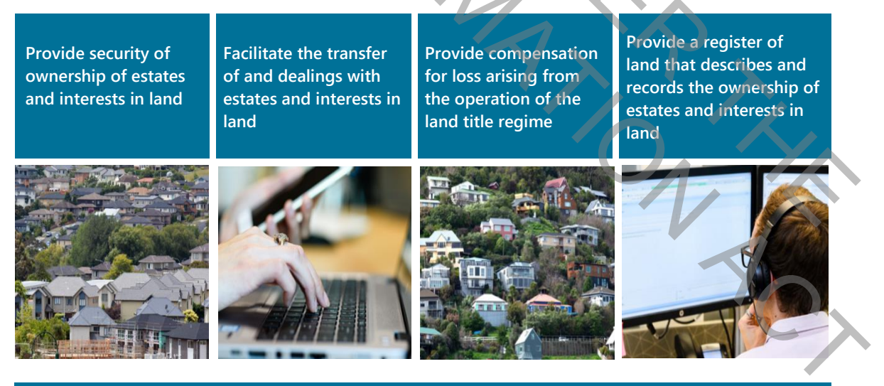
Figure 6: Principles of the Torrens system of land title in New Zealand

Land registration and the transfer of titles provides the basis for owning and using property throughout New Zealand. Property in the land register includes houses, commercial real estate and a range of infrastructure. Figure 7 provides an example of recent land title work for land affected by the Christchurch earthquakes.