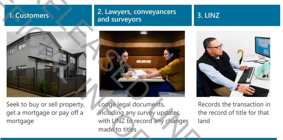
Figure 9: Land title registration

Organisations representing property professionals want to ensure the property rights regime meets their needs and the needs of their clients. These organisations may engage with you to discuss the regime. Engagement generally includes meetings with the heads of key organisations ( Annex 1 ), invitations for you to speak at industry conferences and ministerial correspondence.