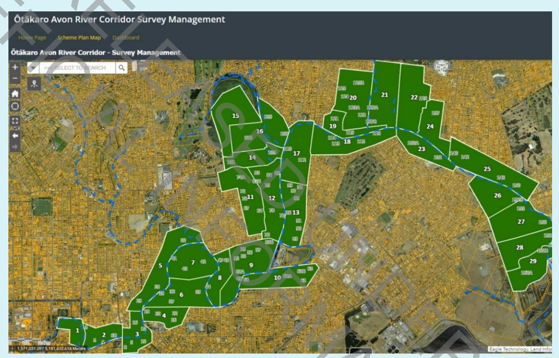
The 29 red zone land parcels along Christchurch's Ōtākaro Avon River Corridor

LINZ amalgamated 5,500 property titles along the Ōtākaro Avon River Corridor into 29 parcels of land. This ensured the council could use the land immediately for regeneration purposes, with many projects already under way.