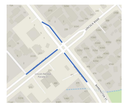
Figure 1: Blue lines showing the approaches investigated

The Lincoln/Barrington/Whiteleigh (Figure 1) intersection was treated with a primary safe system intervention to reduce death and serious injury crashes at the intersection. The Raised Safety Platform (RSP) is a primary safe system intervention, which manages the speeds of vehicles travelling through an intersection. Only the three approaches shown in (Figure 1) have been investigated due to 50 km/h speed limit. Lincoln Road to the north is posted at 30 km/h.