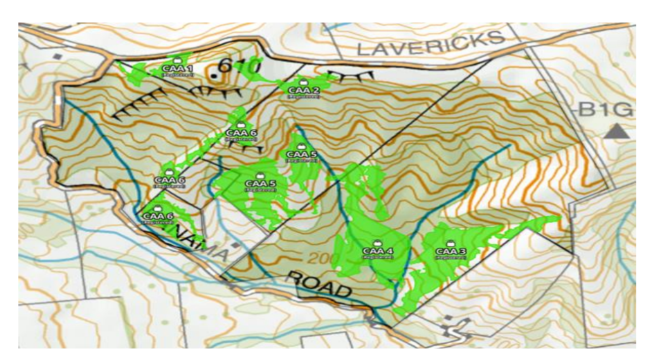
Figures 2 and 3 - Non-ETS registered forest adjacent to ETS registered forest closeup and from a distance for location context: