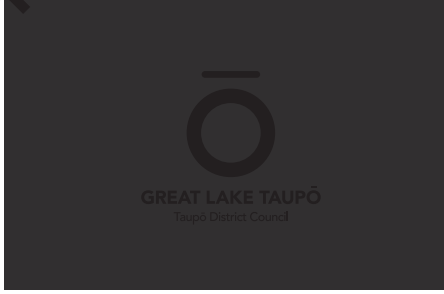
black logo over colour without enough contrast

white logo over colour without enough contrast