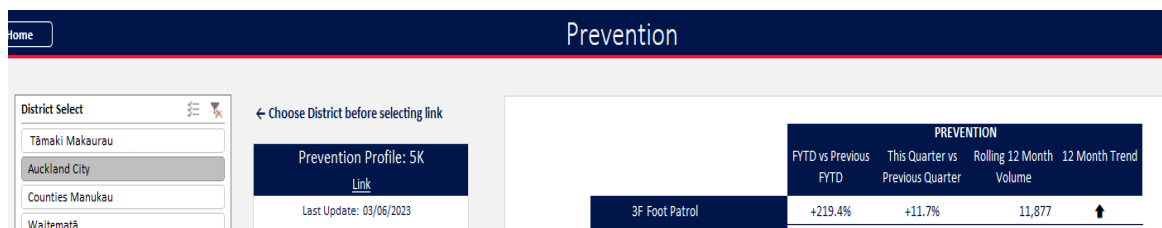
Table 1A: Prevention, 3F Foot Patrols, Auckland City, FYTD.

On a calendar year to date basis there were 1272 foot patrols in 2022 across the Auckland Central Area versus 4363 foot patrols in the same period for 2023. This equates to a 243% increase.