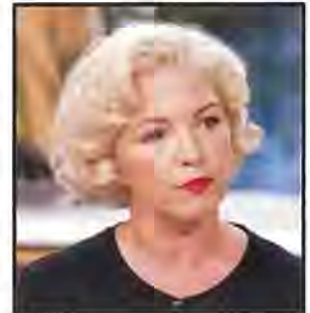
Fig 1. Kellie-Jay KEEN-MINSHULL