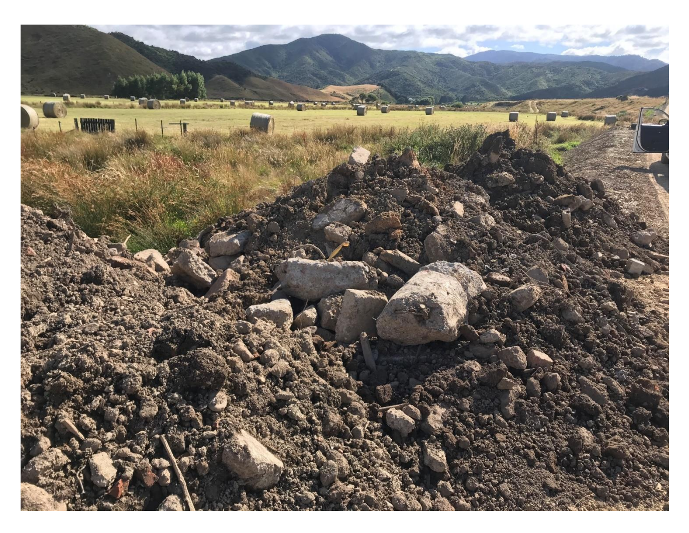
Figure 6. Stockpiles.