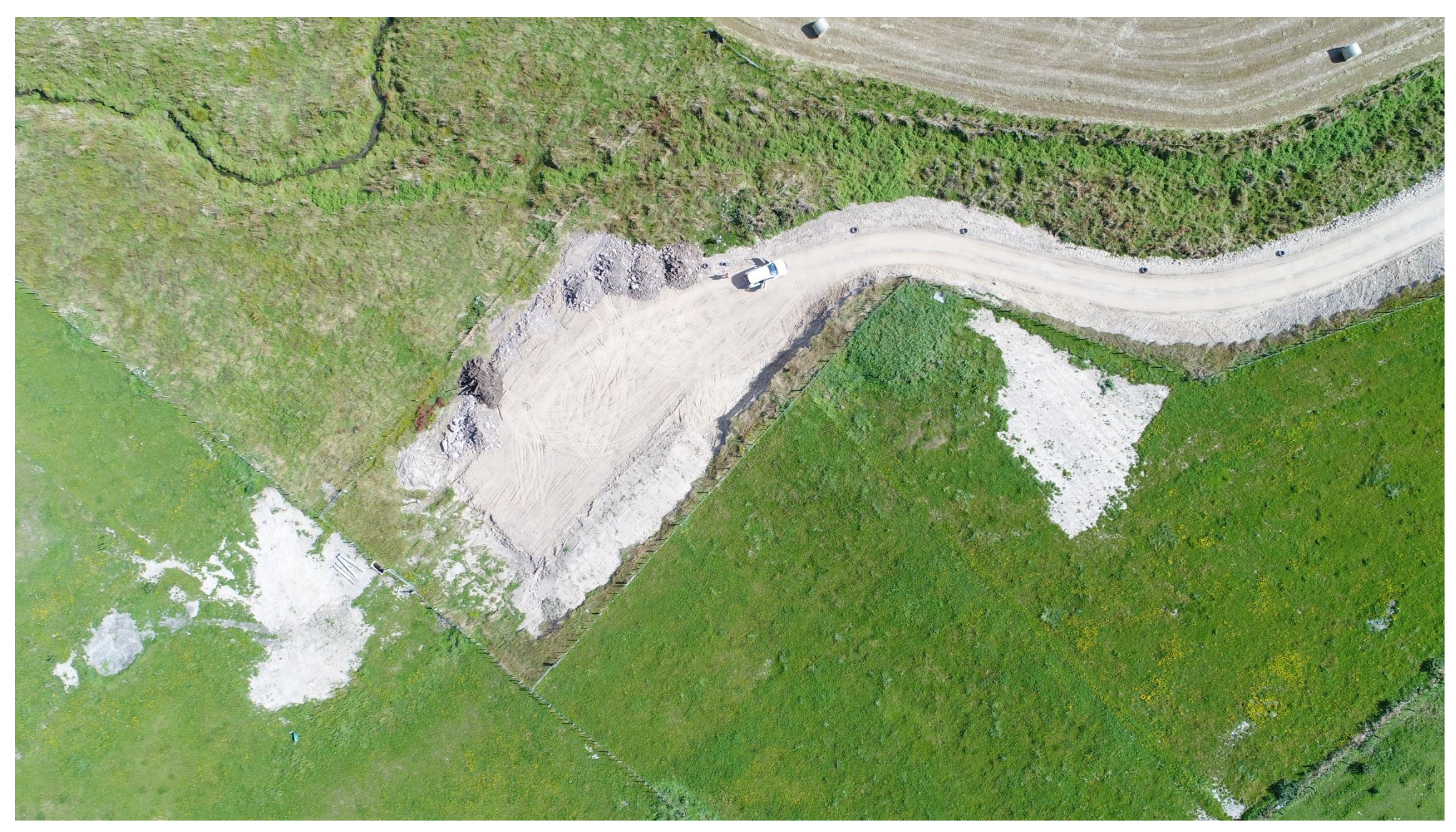
Figure 2. Platform and stream.