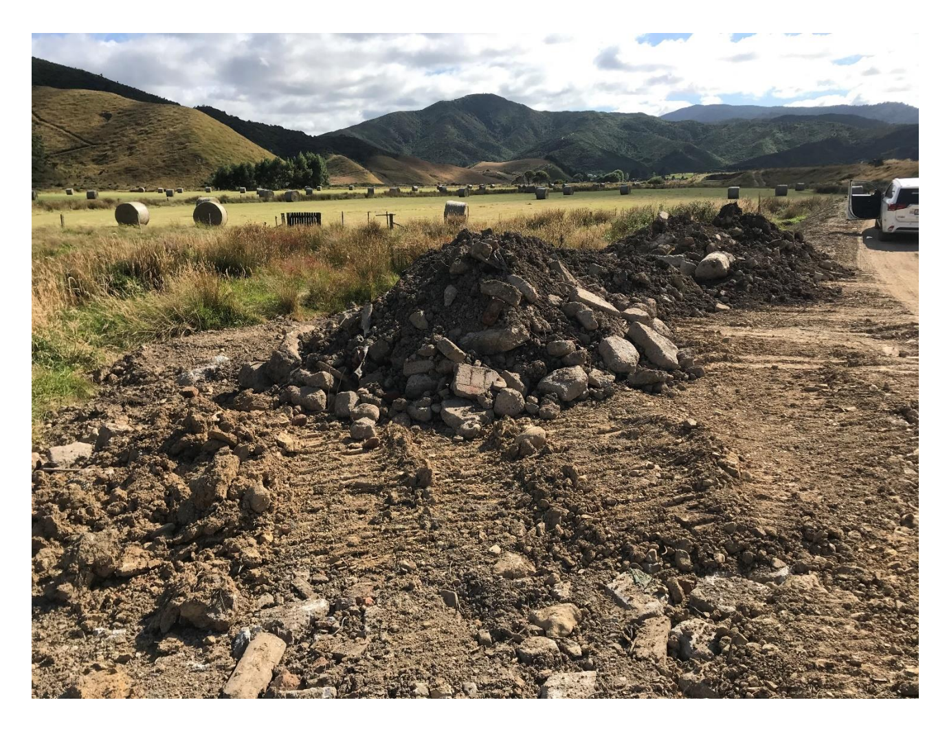
Figure 5. Stockpiles