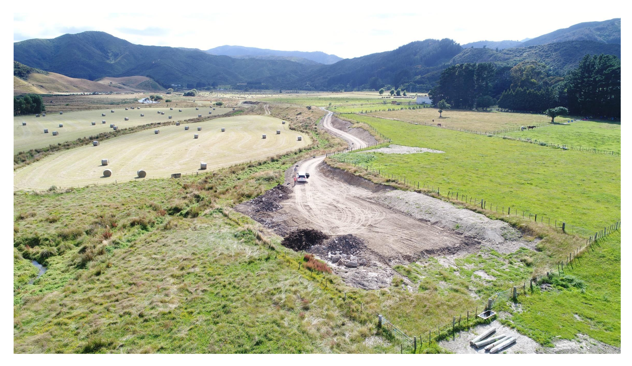
Figure 3. Platform and farm road/haul road.