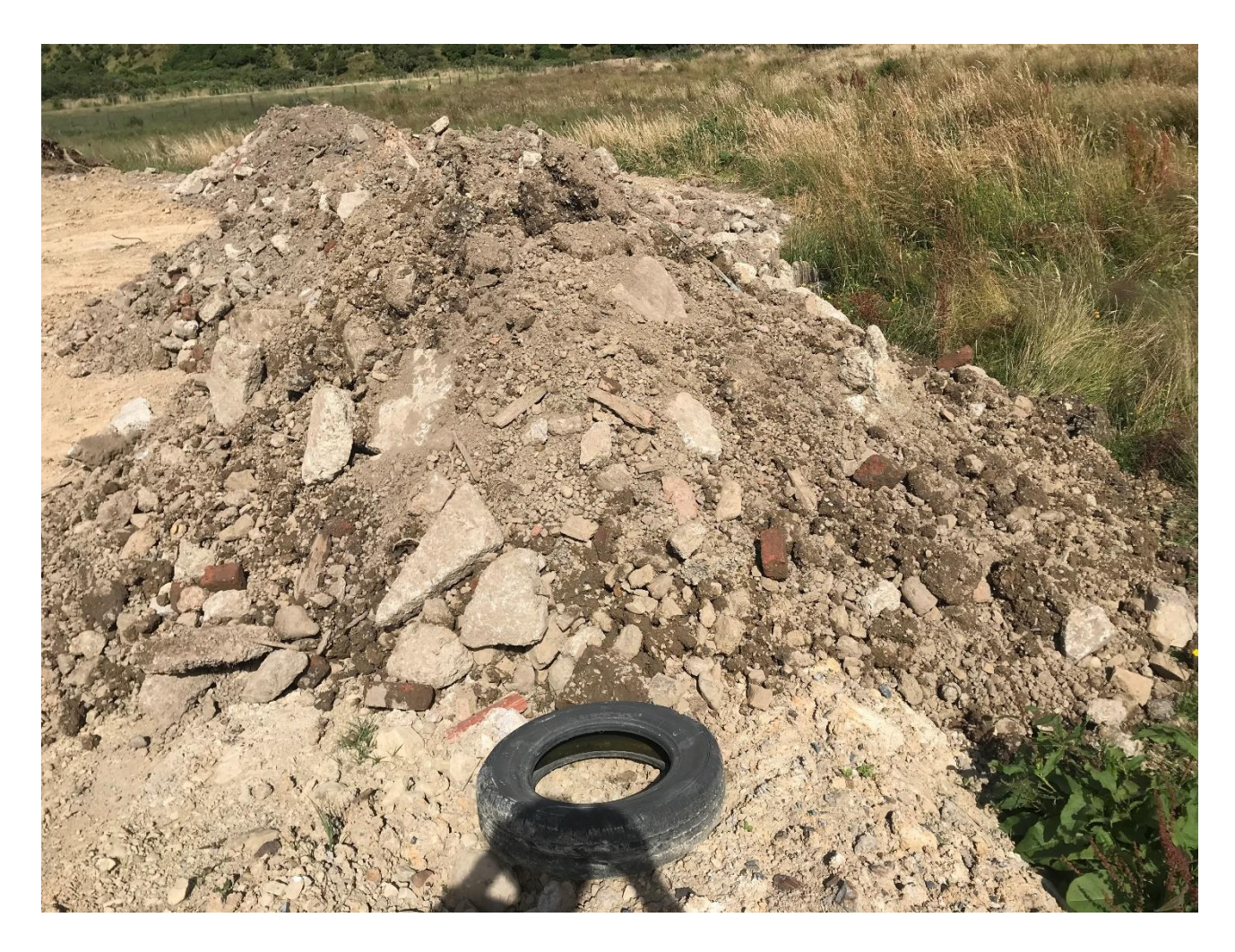
Figure 7. Stockpiles.