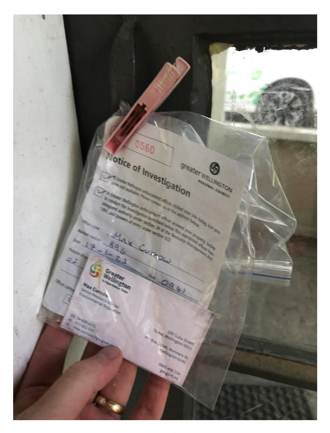
Figure 1. Notice of inspection left on door.