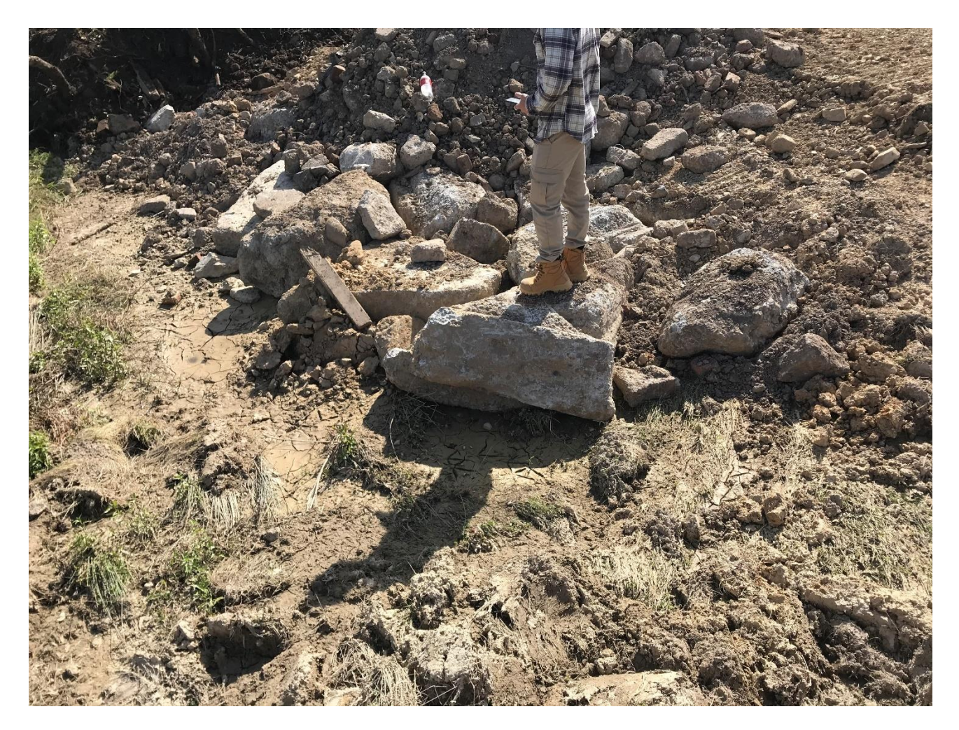
Figure 4. Stockpiles

There were approximately half a dozen stockpiles of material on the platform. Soil, concrete, brick, rebar, and a tire were observed.