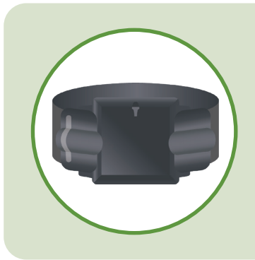
Smart Tag The tracker which is fitted around your ankle