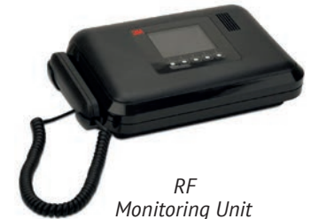
RF Monitoring Unit