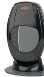
GPS Monitoring Unit