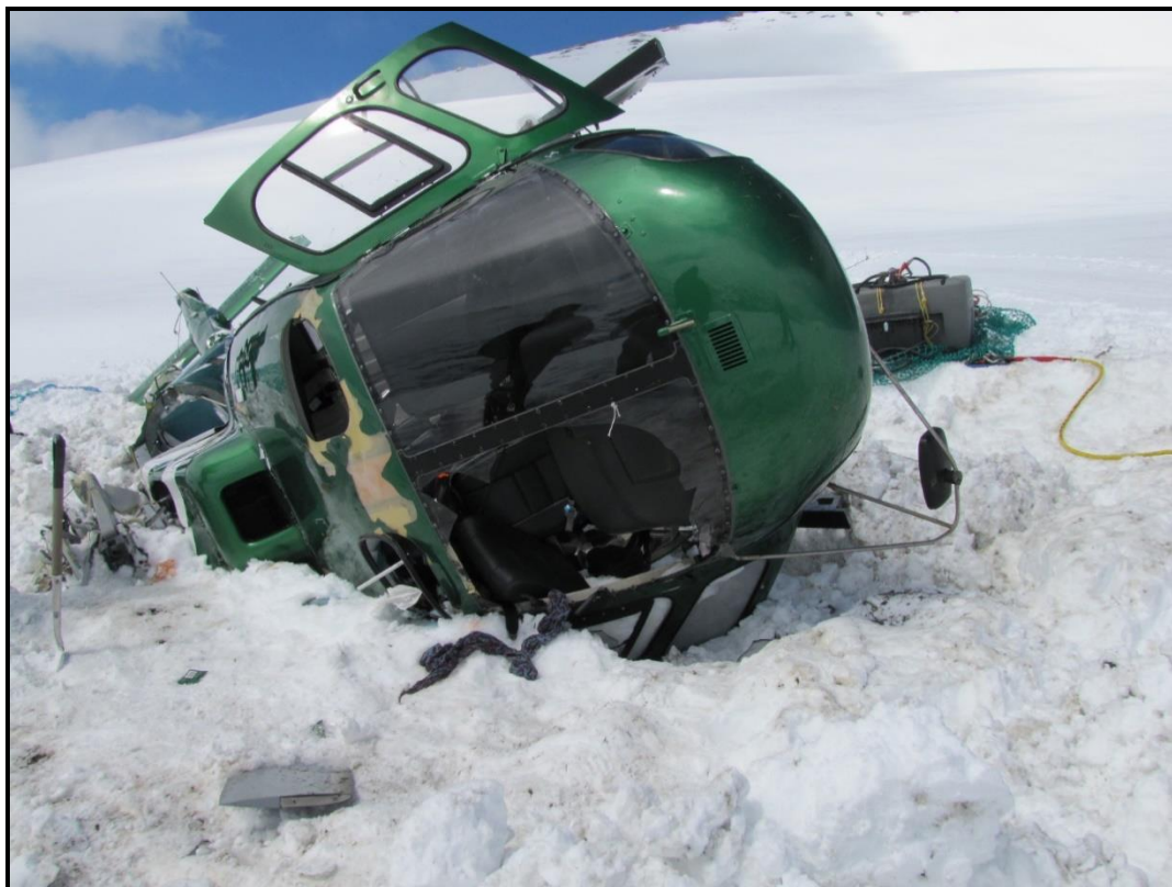
Figure 2 The helicopter after the accident (with de-fuelling kit alongside)

3.3.1. The helicopter came to rest on its right side (see Figure 2). The main rotor blades were attached but had shattered from striking the snow while under power. The tail assembly had fallen about 15 m in front of and to the right of the parked helicopter. The severed lower vertical stabiliser was located, but the removed section of tail rotor blade was not found. The front-left cabin door was detached in the ground impact.