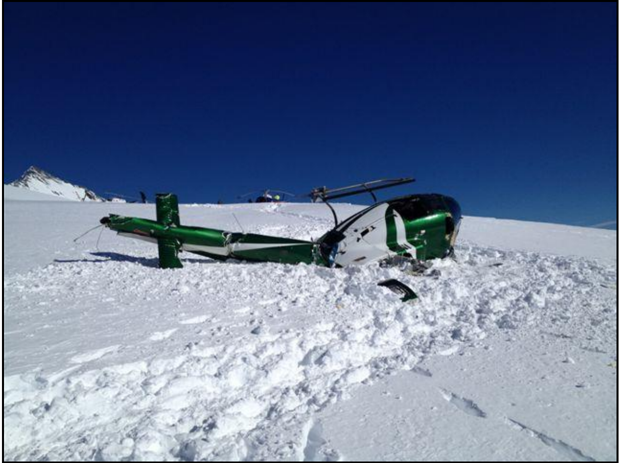
The accident scene, with ZK-IMJ in the foreground and ZK-HAE in the background