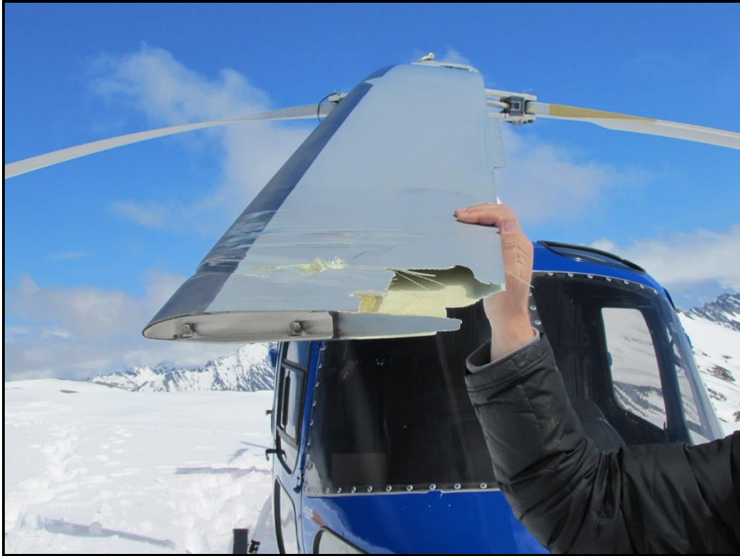
Figure 3 Typical damage to the main rotor blades of the parked helicopter