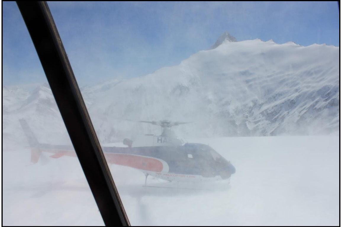
Figure 1 The parked helicopter as seen on the go-around from first approach