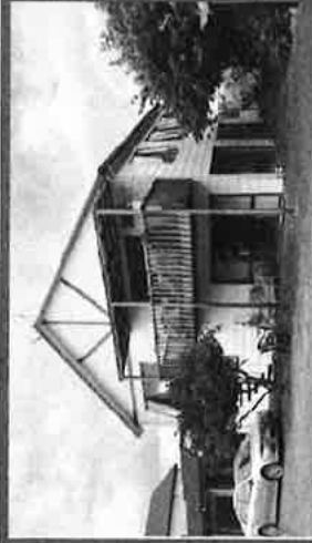
Potential CRTH site #1 240 Rangjuru Road, Te Puke (Dowman Lodge)