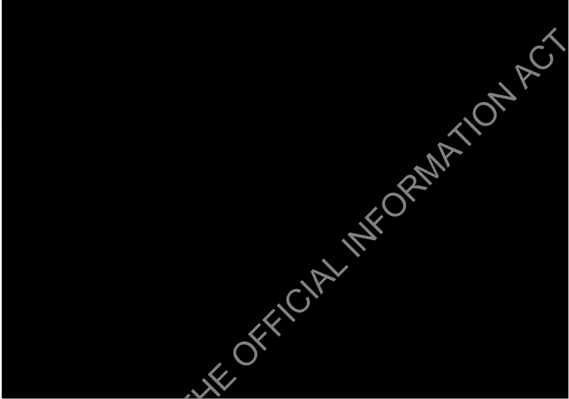
Figure 2: Property Division 9(2)(b)(ii)