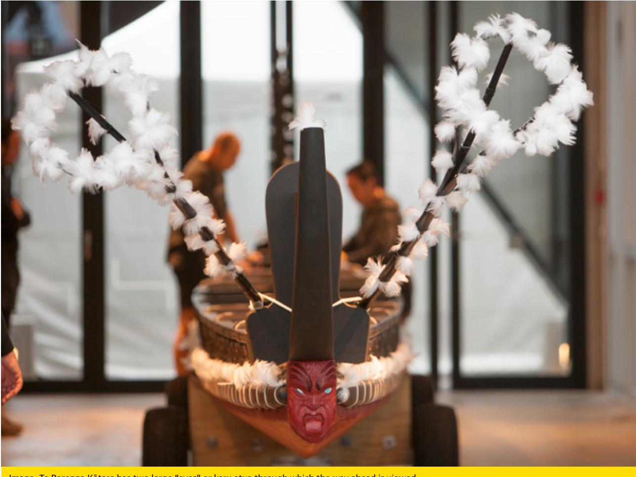
Image: Te Rerenga Kōtare has two large "eyes" or karu atua through which the way ahead is viewed.