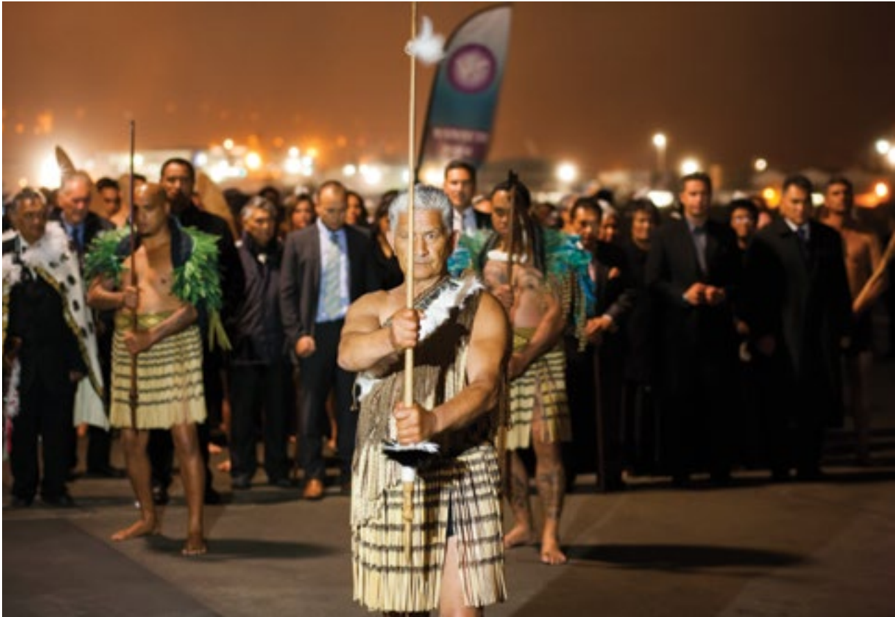
Whakaahua (photo): Opening ceremony for Te Raukura, te wharewaka o Pōneke.

Iwi and Māori are the kaitiaki of the Māori language and the language is the foundation of Māori culture and identity. The knowledge and use of the Māori language enhances the lives of all Māori. It is sustained through transmission of the language from generation to generation among whānau and daily use in the community. All New Zealanders are encouraged to learn and use te reo Māori to support its national revitalisation.