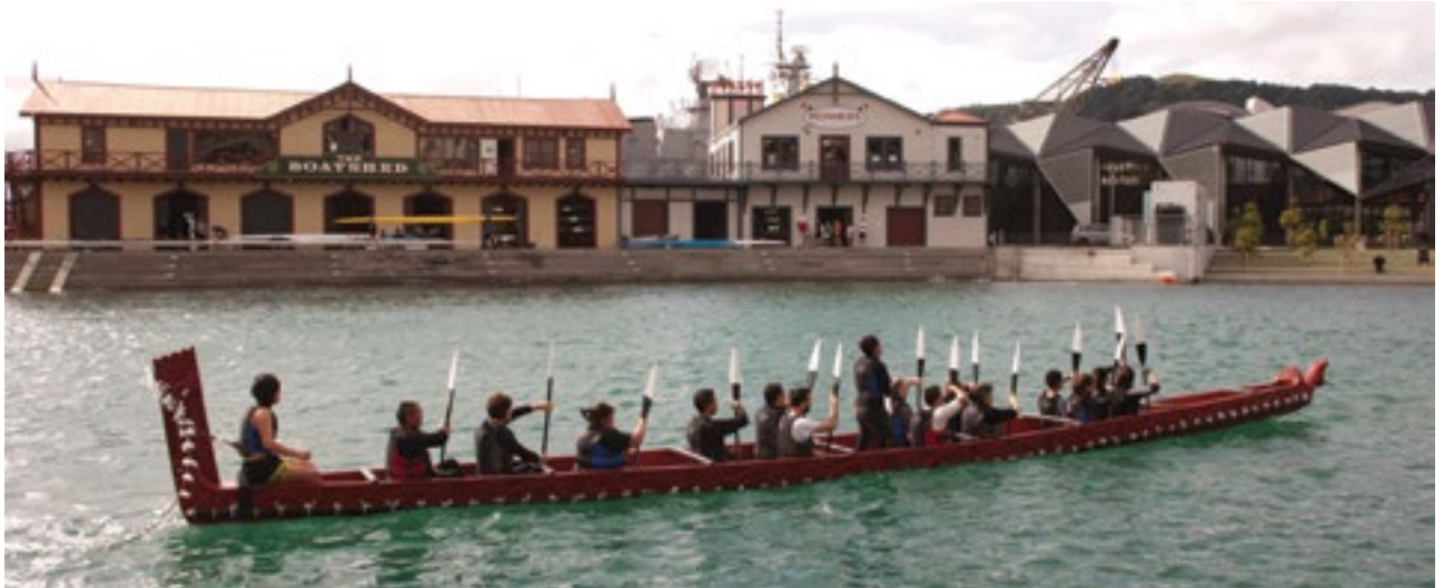
Whakaahua (photo): Te Hononga, waka tetekura on Whairepo Lagoon