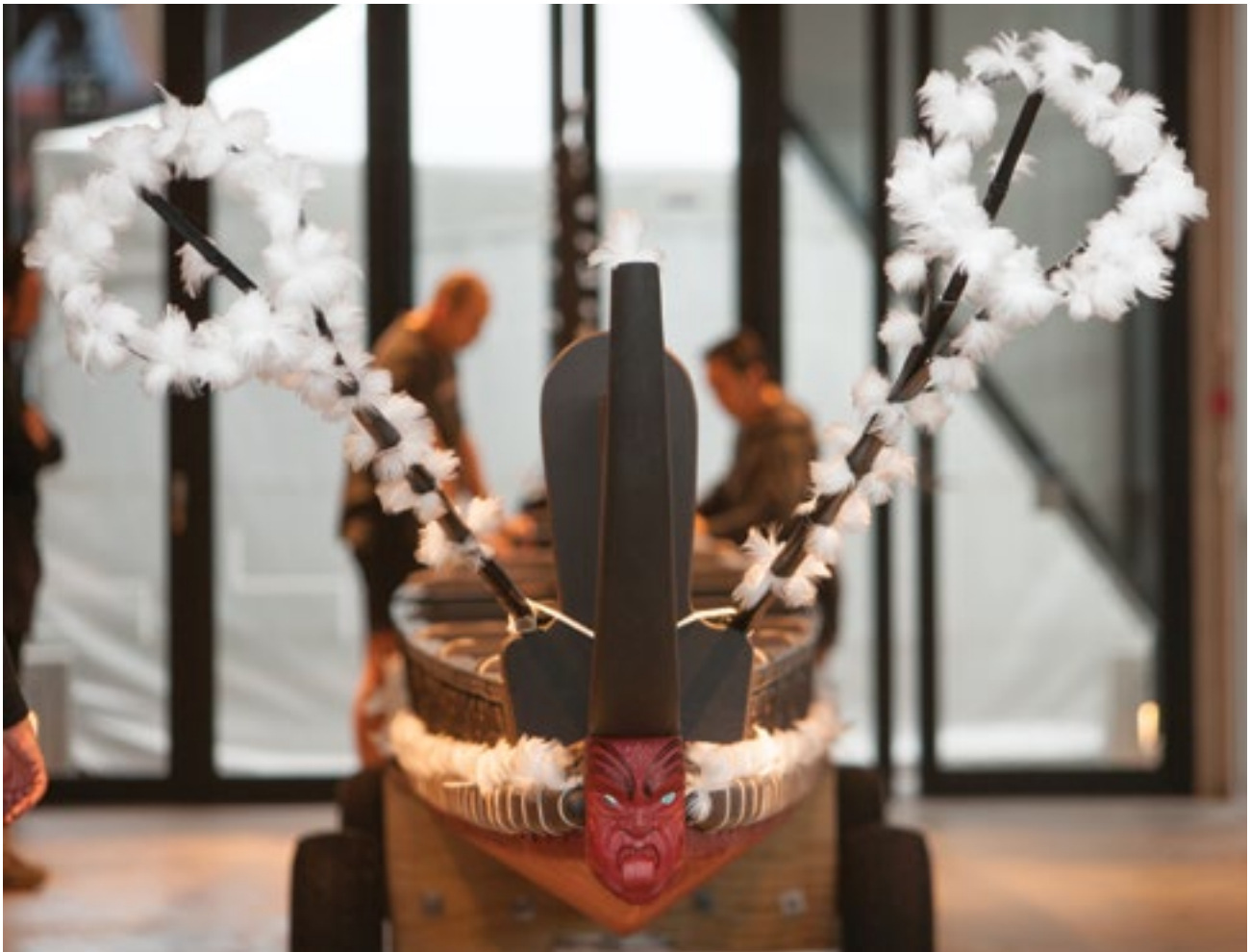
Whakaahua (photo): Te Rerenga Kōtare, waka taua kei Te Raukura te Wharewaka o Pōneke

Te reo Māori can provide that same resilience and strengthen our Council whānau to deliver our organisational objective to actively protect taonga and safeguard Māori cultural concepts, values and practices to be celebrated and enjoyed by all.